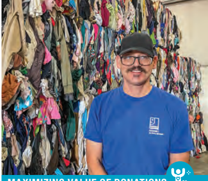
MAXIMIZING VALUE OF DONATIONS 🗤

250 empowering jobs in Northern Michigan