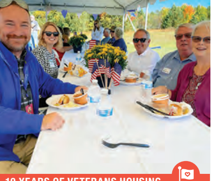
10 YEARS OF VETERANS HOUSING

The smiles on the faces of our friends at Kalkaska Area Interfaith Resources say it all! Grateful to deliver 1,600lbs of strawberries and 3,200lbs of whole milk rescued from Sams Club to food pantries in Antrim and Kalkaska counties, at no charge to the pantries, and thankful to pantries for getting wit to people who need it.