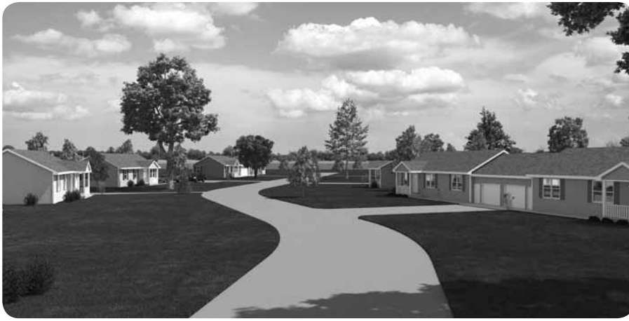
Artist rendering of Goodwill's Veterans Transitional Housing Community